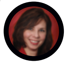
By Audra Szollosy

With the exception of January—June and July displayed the most M&A activity this year with 27 and 28 transactions, respectively. The first seven months of 2008 are just slightly ahead of 2007’s pace, but the buyers have changed significantly. Insurance brokerages continue to dominate the consolidation landscape besting last year’s pace by 19%. The largest deal to date—the $2.1 billion acquisition of the world’s ninth largest brokerage, Hilb Rogal & Hobbs—was made by Willis, the third largest broker.